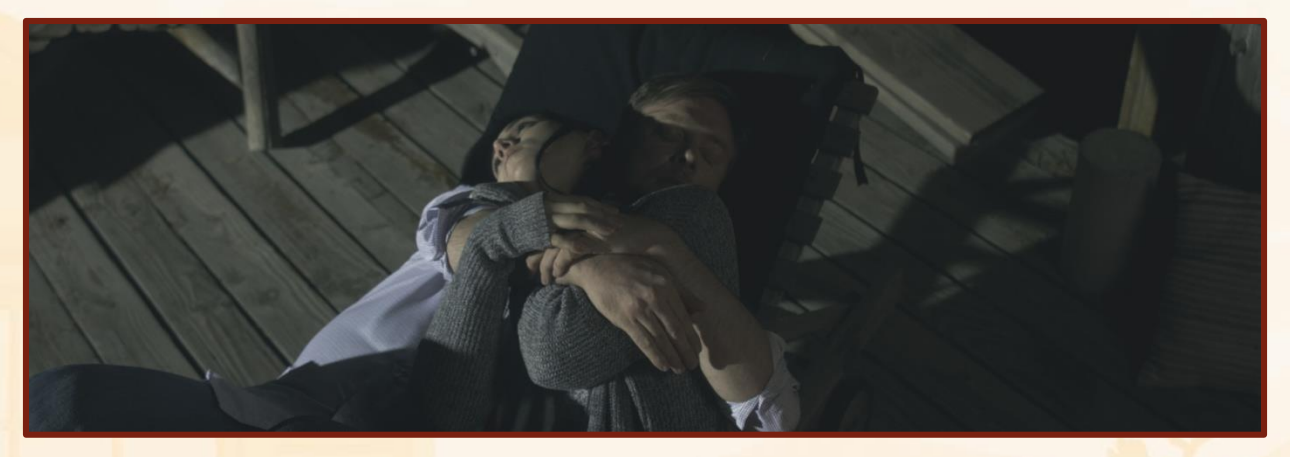
"R&R" (2018, USA, 13'13")